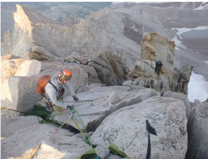
Dave Spies belays Steven Stosky through the decomposing hoodoos at the very top of the wall during the first ascent of Humphrey Dumphrey (1,200', III 5.8) on the east face of Mt. Humphreys (13,986').