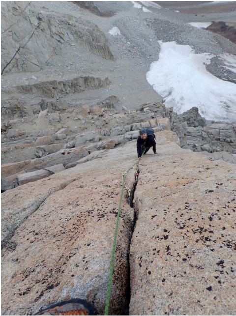
Steven Stosky nears the top of the headwall splitter on the sixth pitch of Humphrey Dumphrey (1,200', III 5.8) on the east face of Mt. Humphreys (13,986').