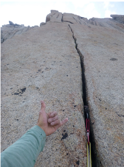
Psyched for the headwall splitter on the sixth pitch of Humphrey Dumphrey (1,200', III 5.8) on the east face of Mt. Humphreys (13,986').