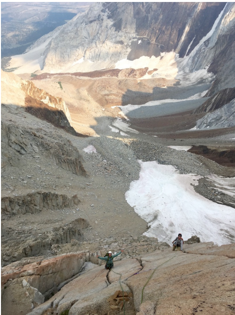
Derek Field and Dave Spies enjoy twin splitters while following the fifth pitch of Humphrey Dumphrey (1,200', III 5.8) on the east face of Mt. Humphreys (13,986').