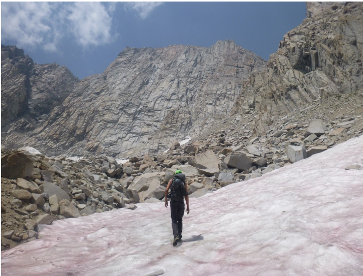
Steven Stosky approaches the east face before making the first ascent of Humphrey Dumphrey (1,200', III 5.8) on the east face of Mt. Humphreys (13,986').