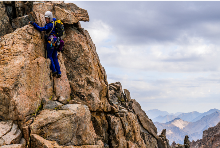
Downclimbing a 4th-class ridge the morning after making the first ascent of Mud Falcon (1,400', IV 5.11- C1) on Ericsson Crag 3 in Kings Canyon National Park.