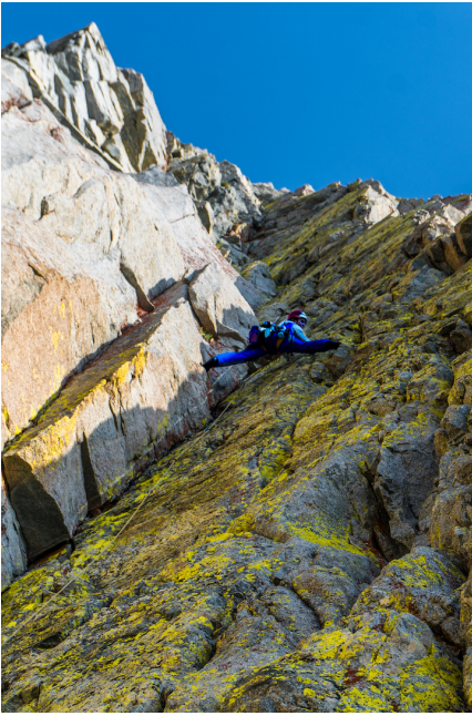
Whitney Clark midway up the lichen-covered dihedral during the first ascent of Mud Falcon (1,400', IV 5.11- C1) on Ericsson Crag 3 in Kings Canyon National Park.