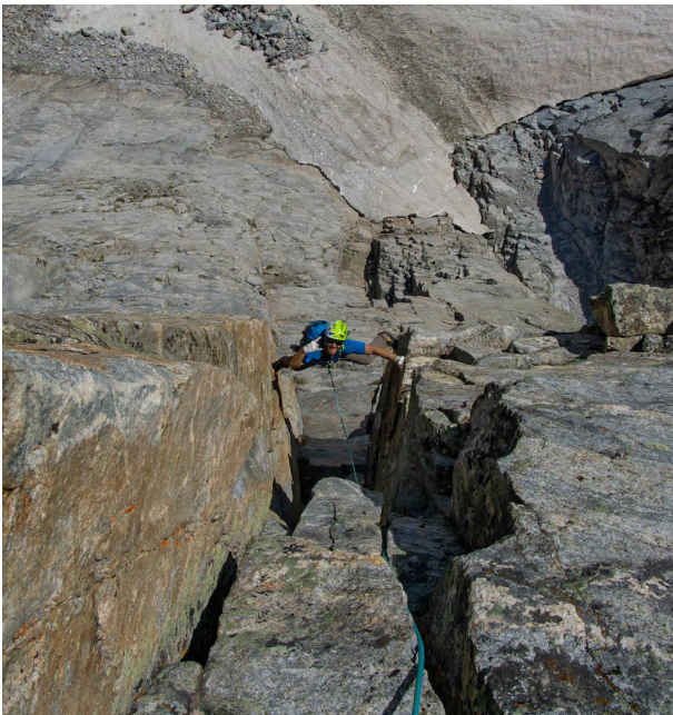
Greg Troutman stoked on stemming during the first ascent of Initech (300m, 6 pitches, 5.10 C2, Evans-Rothenbush-Troutman), one of 12 new routes completed in the Wolverine Peak cirque in August 2018.