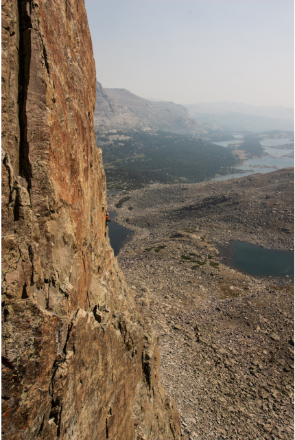
Heath Rowland on pitch one of Trundor and Bummus (5.8+) on the Front Buttress.