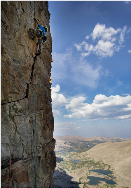
Greg Troutman leads a steep splitter on pitch six of Inirode (300m, 6 pitches, 5.11-, Evans-Rothenbush-Troutman), one of 12 new routes completed in the Wolverine Peak cirque in August 2018.