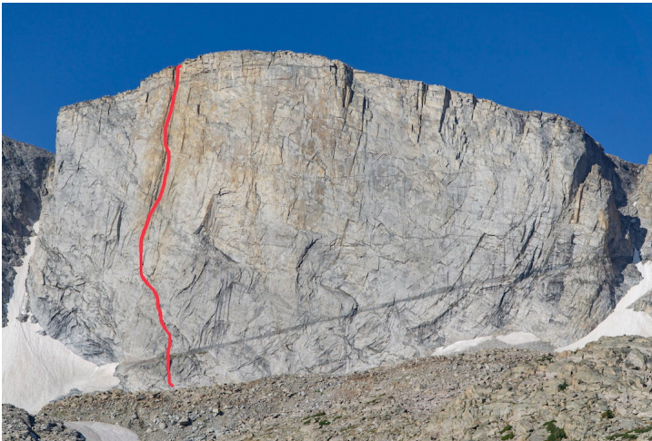
The east face of Point 12,612', in the Wolverine Peak cirque of Wyoming's Wind River Range, dubbed the Shield by the 2018 party. The approximate line of the Illness (V 5.10 A3, Chilton-Garrett-Hokanson, 1999) is shown.