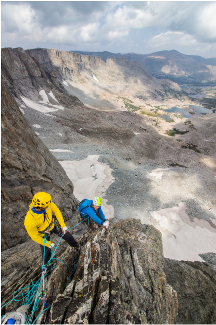
Greg Troutman (belayed by Nick Rothenbush) nearing the summit of Lightning Rod Spire during the first ascent of Ride the Lightning (310m, 7 pitches, 5.8), one of 12 new routes climbed in the Wolverine Peak cirque in August 2018.