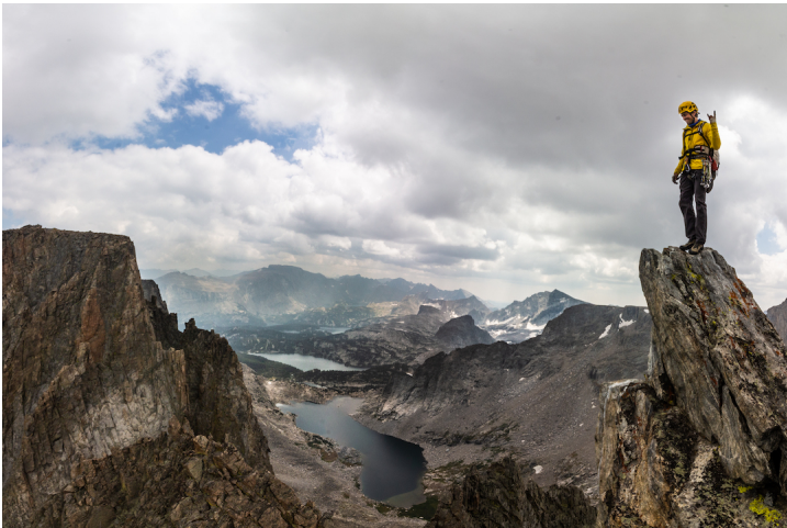
Nick Rothenbush on the summit of Lightning Rod Spire after making the first ascent of Ride the Lightning (310m, 7 pitches, 5.8), one of 12 new routes climbed in the Wolverine Peak cirque in August 2018.