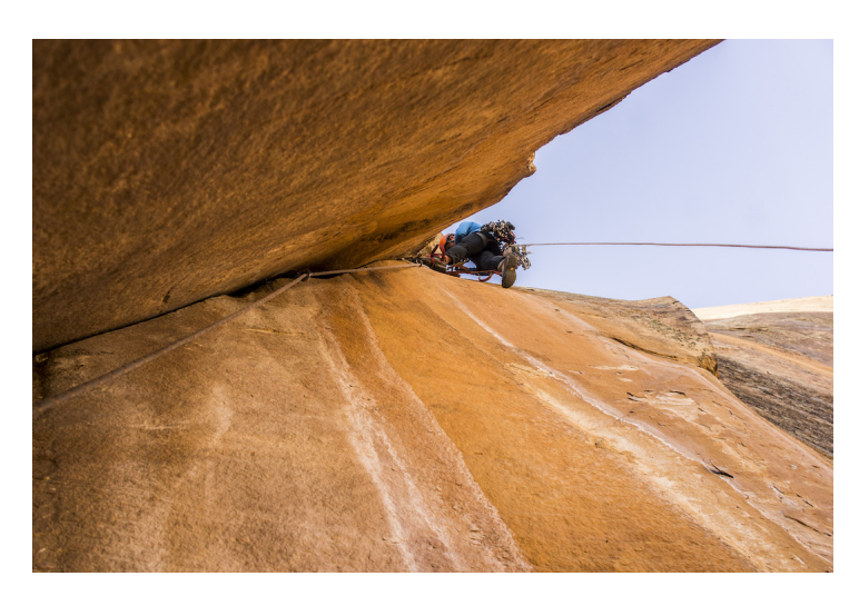
Kyle Willis aiding out another steep section on pitch five of Jedi Mind Tricks (2,000', V 5.10 A2) on Mt. Wilson's Aeolian Wall.