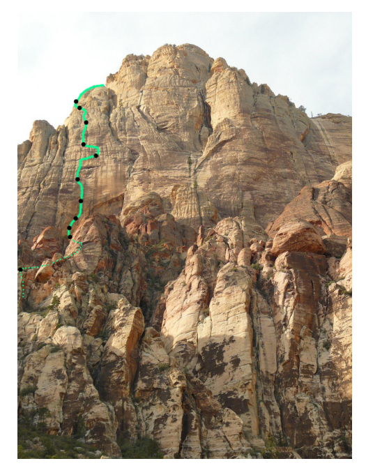
The Aeolian Wall on Red Rock's Mt. Wilson, showing the line and belays of Jedi Mind Tricks (2,000', V 5.10 A2).