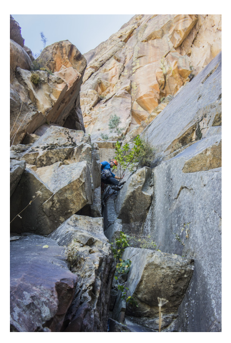
Kyle Willis on pitch two of Jedi Mind Tricks (2,000', V 5.10 A2) on Mt. Wilson's Aeolian Wall. The overhanging system that defines the meat of the route can be seen in the upper right.