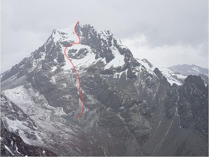
The solo new route on the northeast face of Rajuntay (5,477m) climbed in May 2018.