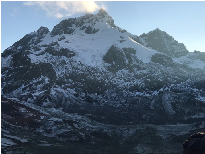
Rajuntay Norte (ca 5,400m) from the west.