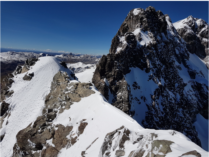
The view from Rajuntay Norte (ca 5,400m) toward the 5,477m main summit.