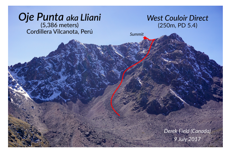
Photo-topo for the West Couloir Direct (250m, PD 5.4) on Oje Punta (5,386m).

A mountain caracara perched on the summit ridge of Oje Punta (5,386m). In the background are (left to right) Concha de Caracol, Puca Punta, Ccapana, and Callangate.