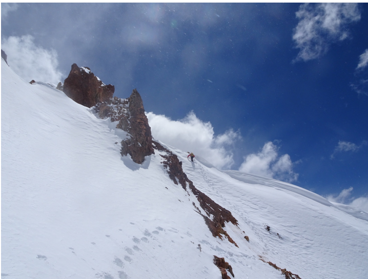
Climbing on Cerro El Escampe.