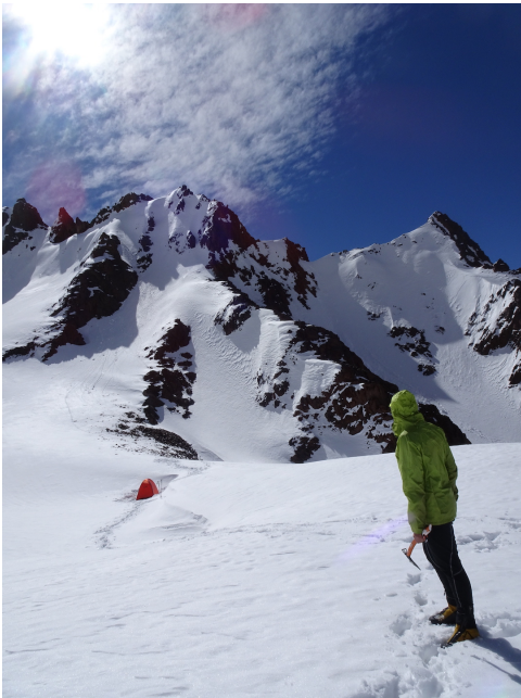
View from high camp in the side valley used to access the northeast face of Cerro Copla Blanca.