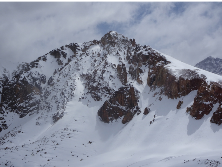
Cerro El Escampe from the southwest. The first ascent gained the south-southeast ridge (right