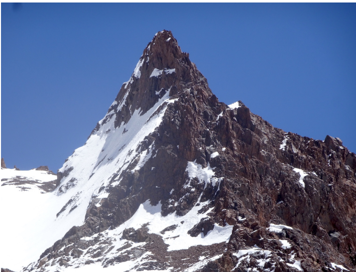
Steep, rocky peaks along the unnamed valley used to access El Escampe and Copla Blanca.