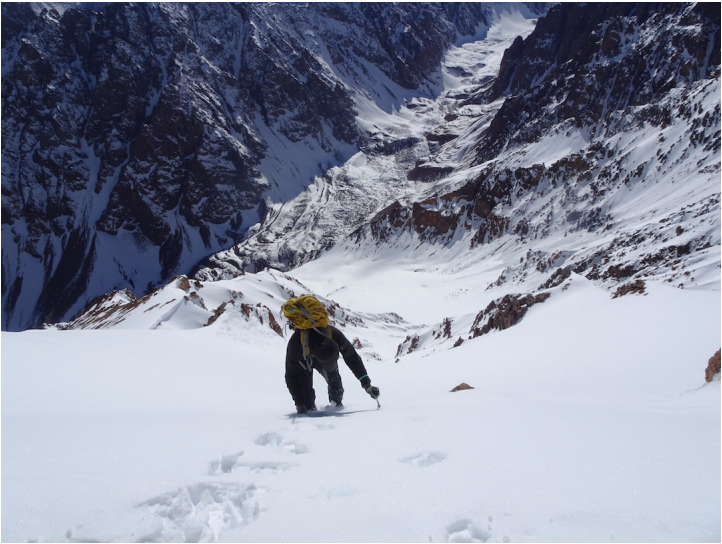
Nearing the summit of Copla Blanca during the first ascent.