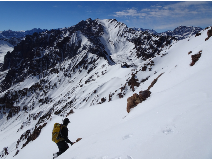
High on Copla Blanca, looking toward the north side of La Nadita, first climbed in November 2008.