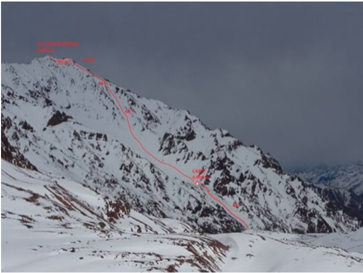
The route followed up the northeast face of Cerro Copla Blanca.