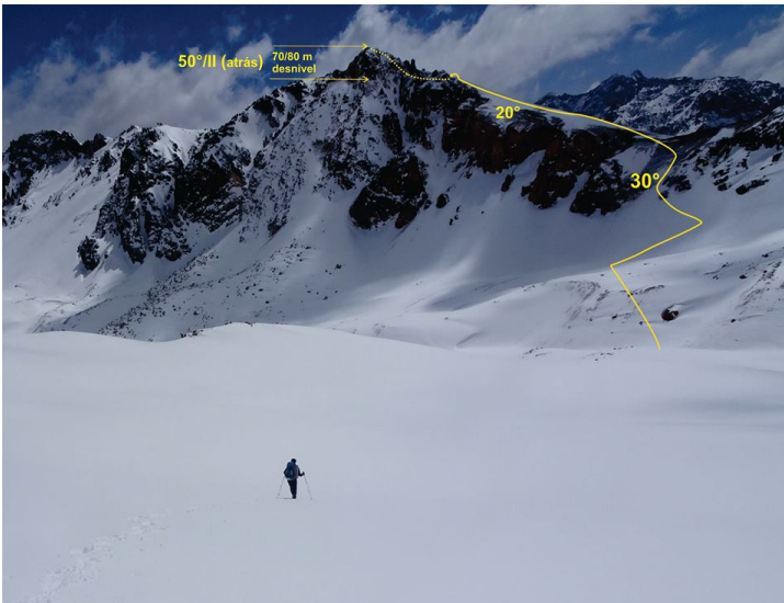
The route of the first ascent of Cerro El Escampe.