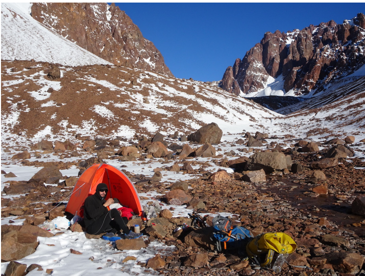
First campsite (ca 3,000m) in the unnamed valley used to approach Cerro El Escampe.