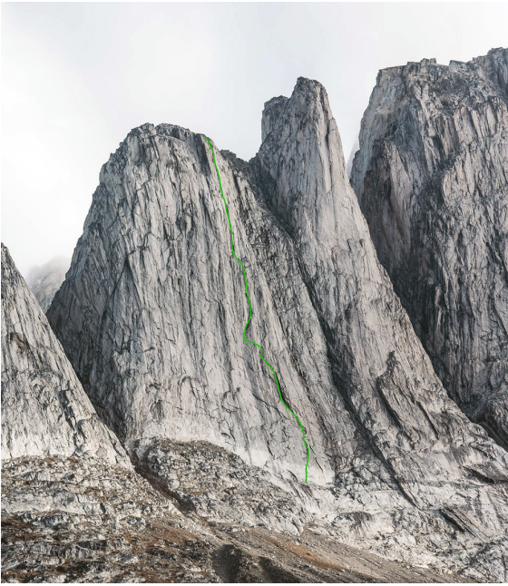
The south face of the Molar and the line of Le Privilege du Renard (450m, 7b, Dumarest-Rolle, 2016). Other routes are not shown.