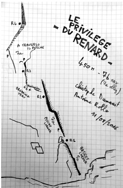
Topo 1 for Le Privilege du Renard on the Molar.