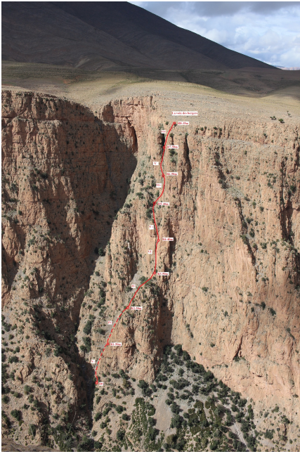
Photo-topo of the new route La Voix des Bergers.