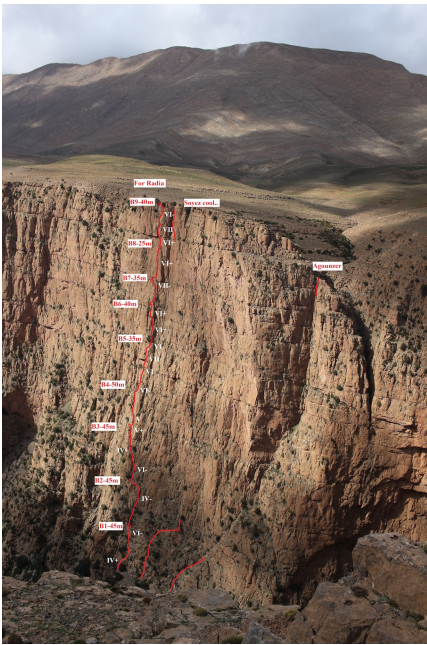
Photo-topo of the new route For Radia.