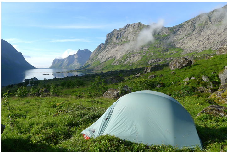
Camp at the head of the Kjerkfjord, looking south toward Reine.