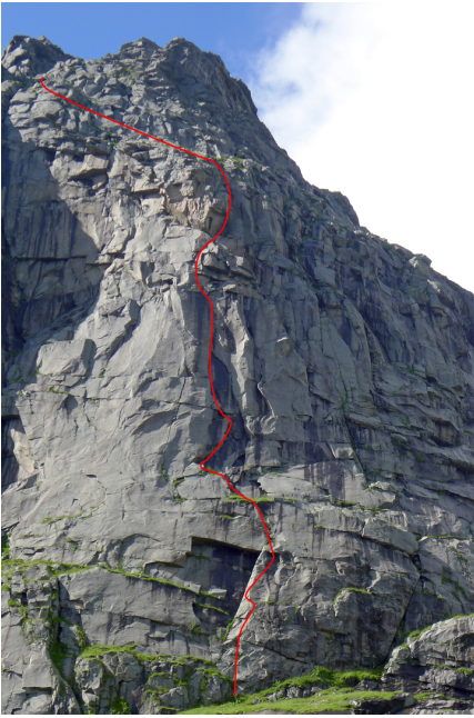
Bilberry Meadow on Merraflestinden.