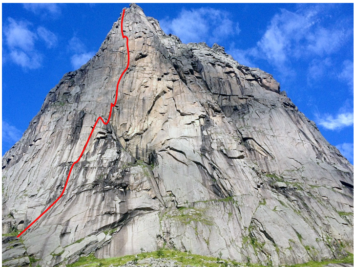
Indiana on Merraflestinden. Bilberry Meadow lies close to the right edge of this image.