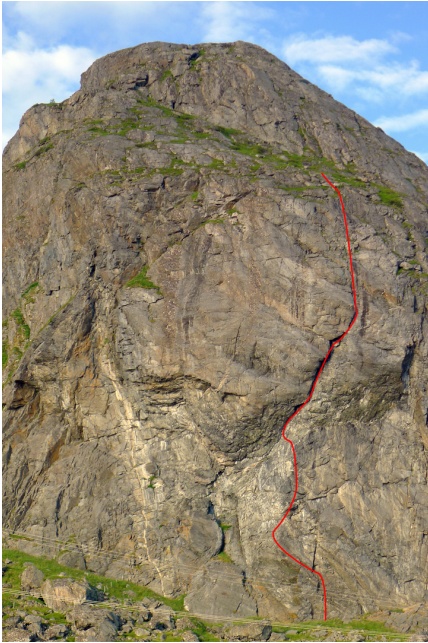
The Ramberg Nubbin and the line of Ramberger.