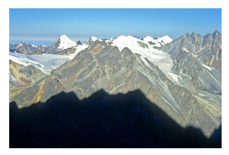
The Negruni peaks (in the mid-1990s) from the west-northwest.