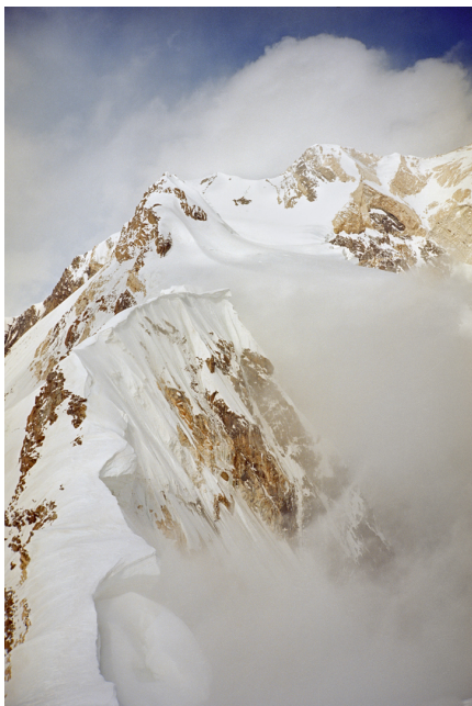
The southwest ridge of Pik Voenna Topografi (6,873m), rising above Chon-Toren Pass opposite Pik Pobeda East.