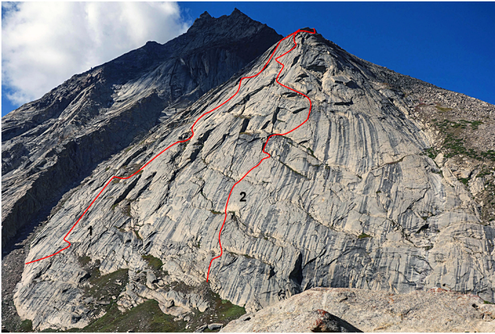
Point ca 4,700m, opposite base camp in the Suru Valley. (1) The Chessboard (2007). (2) My Local River is a Nightmare (2017).