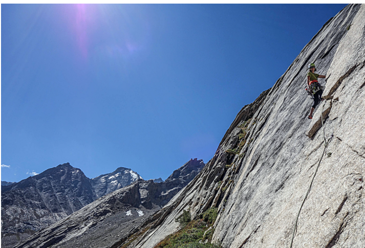
Babsi Vigl on the first ascent of My Local River is a Nightmare, Point ca 4,700m, Suru Valley.