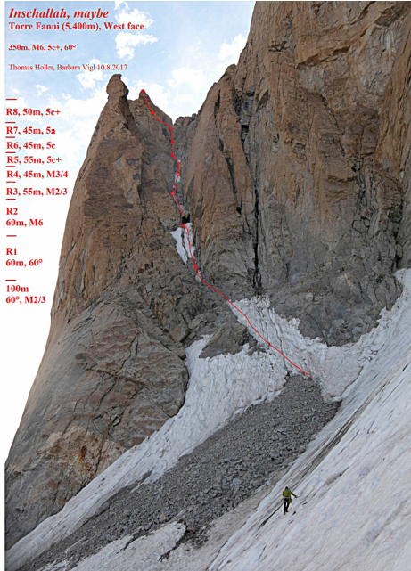
Inshallah, Maybe on the west face of Torri Fanni, Jamyang Ri.