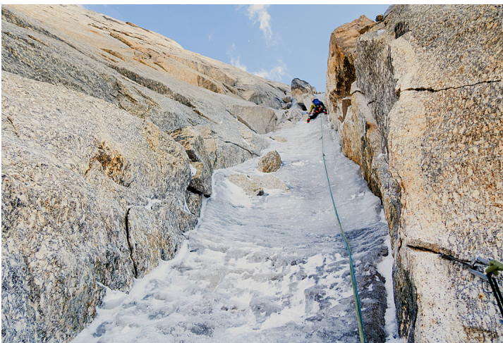
The second ascent of the ice gully of Estética Goulotte, northwest face of Shafat Fortress.