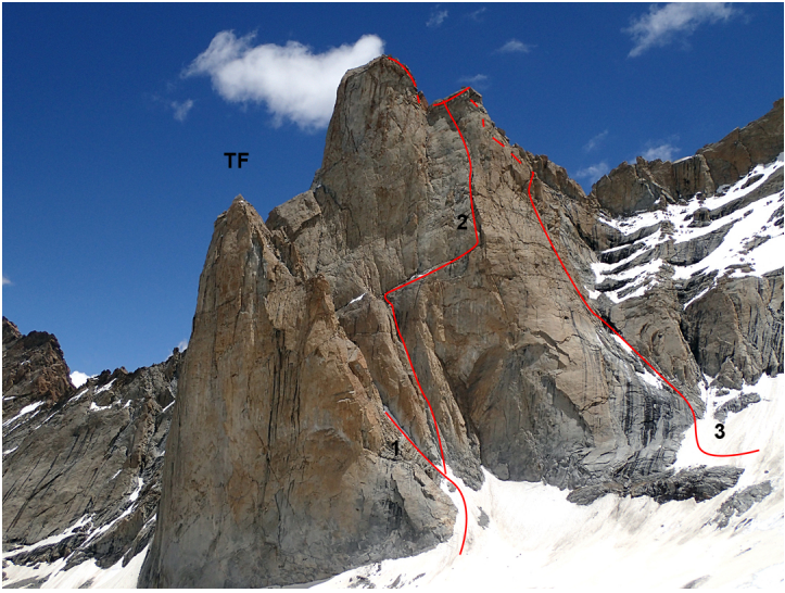
Jamyang Ri (5,800m) from the west. (1) Inshallah, Maybe to the top of (TF), Torre Fanni (ca 5,600m, 2017, Austrian). (2) Cunka (2017, Slovenian). (3) Dust-From Dusk till Dawn (2017, Austrian).