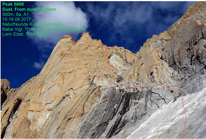
Dust-From Dusk till Dawn on the southwest face of Jamyang Ri.