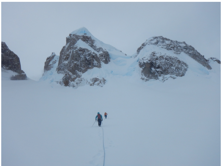
Approaching Cerro Fantasma.