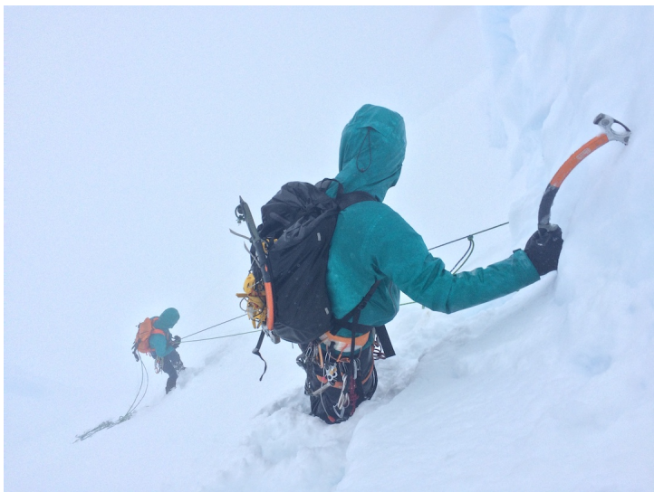
Descending Cerro Fantasma in whiteout conditions.