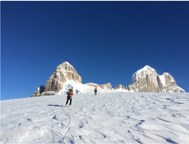
Approaching Pantragrue (left). The peak at right is Gargantua.