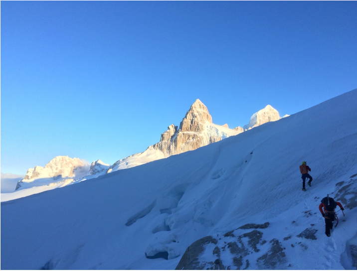
Approaching Pantagruel (center). The peak at right is Gargantua.