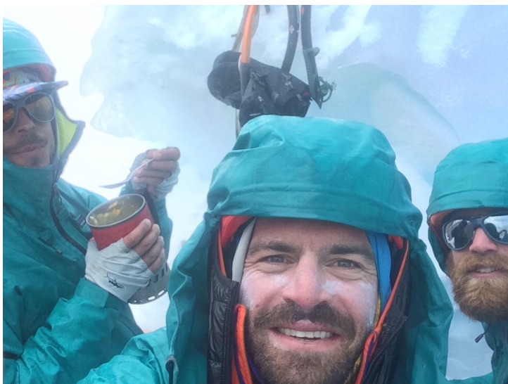
The team during the descent from Cerro Fantasma.