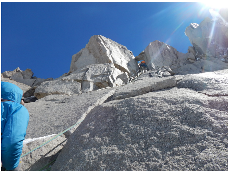
Felipe Cancino climbing during the first ascent of Pantagruel.