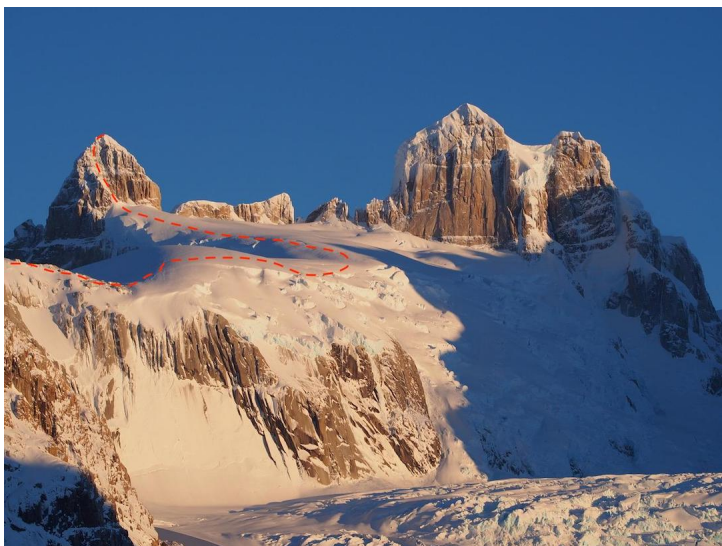
Approximate route of the first ascent of Punta Pantagruel. Cerro Gargantua is to the right.