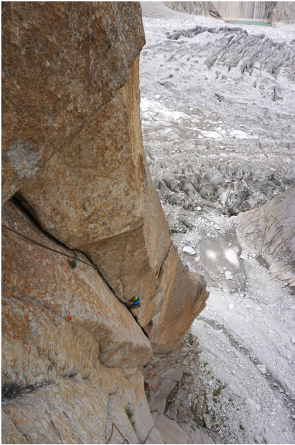
A fine corner crack on Sandwasser & Kasnudeln (400m, 7a+) on Uli Biaho Gallery.