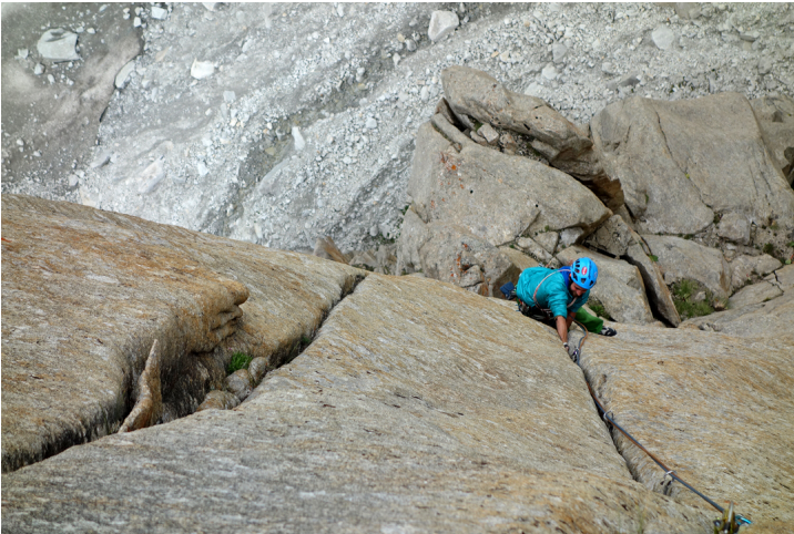
A lovely hand crack on Mountain Medicine (400m 6c C2) on Uli Biaho Gallery.