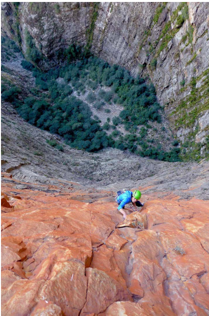
Ines Papert high on A Private Universe (550m, 7b+), established in 2002 at Slanghoek Amphitheatre. The 2017 team repeated this route as a warmup for their new line Ruby Supernova (13 pitches, 5.12c).