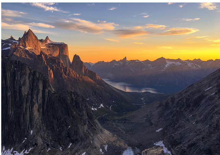
Looking southwest from RDVN down to the Tasermiut Fjord. The highest pointed summit on the left is Ulamertorssuaq North (1,830m), while across to its right can be seen, in profile, the top of the barrel-shaped buttress taken by routes like War and Poetry. Just to the right of this buttress, and lower, is the detached tower of Little Ulamertorssuaq (a.k.a. Pyramid, 1,400m). The conspicuous pointed peak on the horizon is Kirkespiret (1,590m), above the Nalunaq Gold Mine.