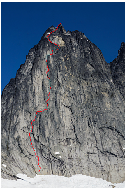
Not my President on the west face of RDVN. The original route on this formation climbed the left skyline ridge.