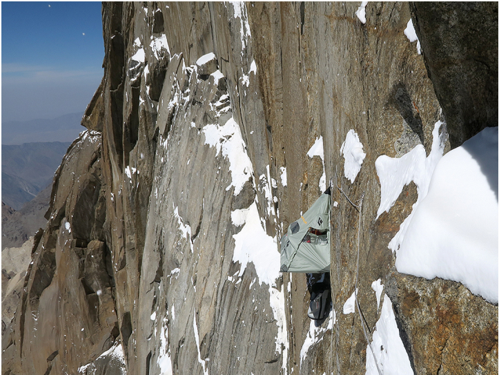
Portaledge camp on the west face of Alexander Blok seen from partway up pitch eight.