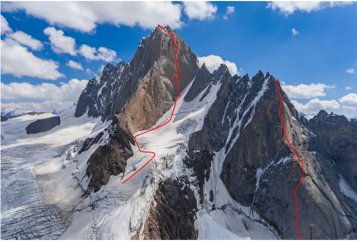
The west face of Alexander Blok, showing the line of Summer Bouquet. Below and to the right is the 2017 line of Alexandra Supernova on Pik 4,800m.