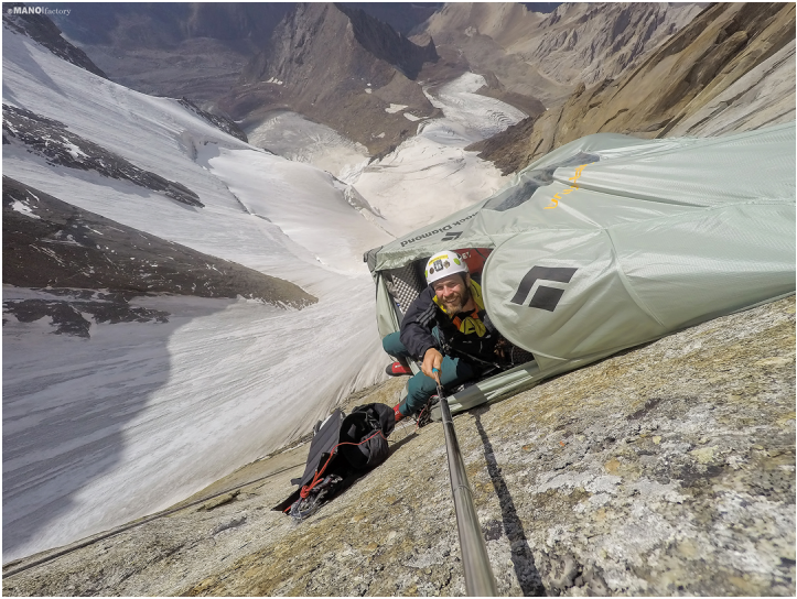
Martin Grajciar at the portaledge camp with the glacier approach below.