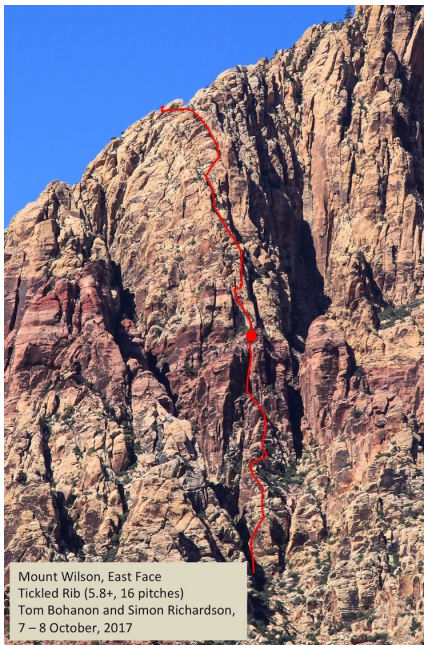
Photo topo for Tickled Rib on Mt. Wilson.