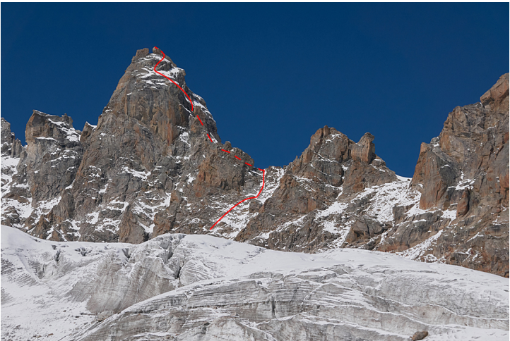
Peak 5,620m and the route of the Japanese first ascent.