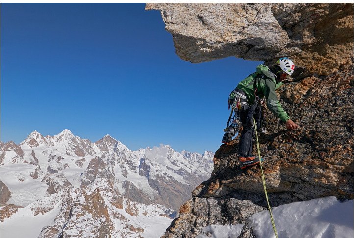
On the upper part of the headwall of the east ridge of Peak 5,620m. In the distance lie the west faces of (left to right): Devchan (6,265m), Papsura (6,451m), and Dharamsura (6,420m).