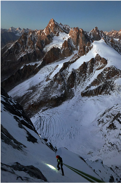
Rappelling into the night during the descent from the summit of Peak 5,620m.