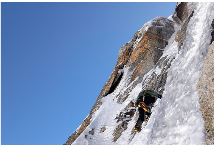
An ice runnel on the headwall of the east ridge of Peak 5,620m. The route continued directly through the slot above the climber.