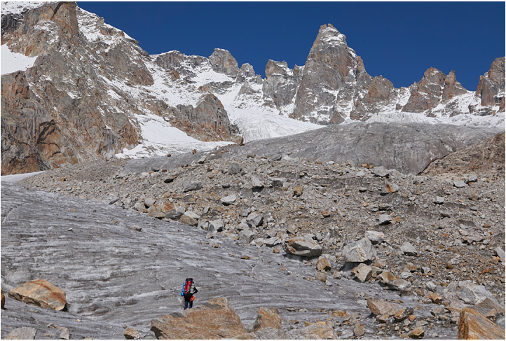
Approaching the rock tower of Peak 5,620m on the upper section of the glacier west of base camp. The peak was climbed by the right skyline ridge.