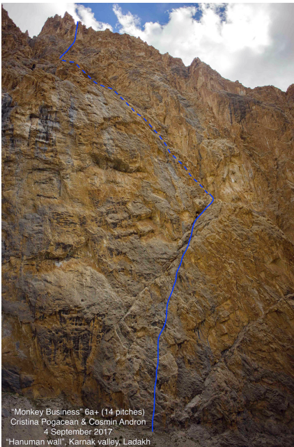
Monkey Business, Karnak Gorge, Ladakh.