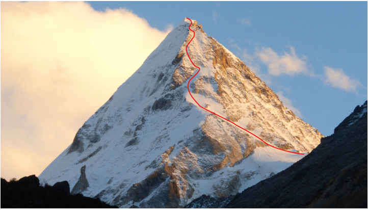
The upper section of the northwest ridge of Xiao Gongga, climbed by both the 2014 and 2017 parties.