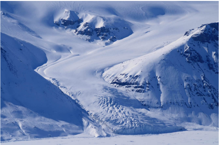
Glacier flowing into South Cape Fiord.