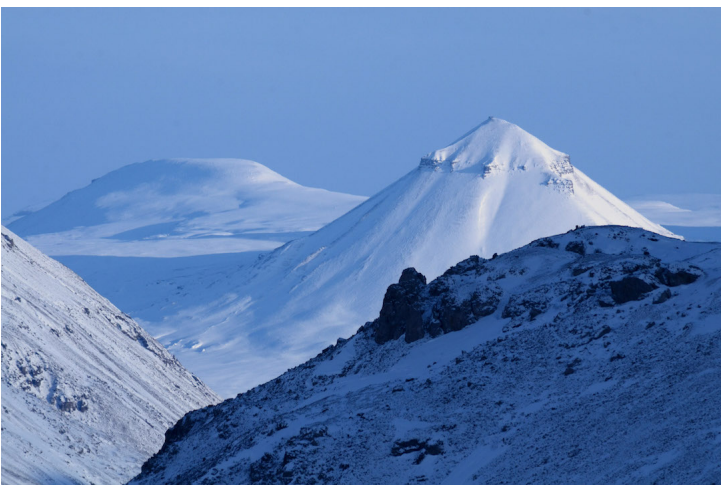
Heim Peninsula from Glacier 16