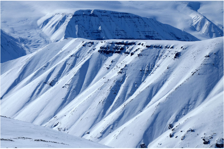
View from Peak 5 southwest toward the Sydkap Glacier. Greg Horne