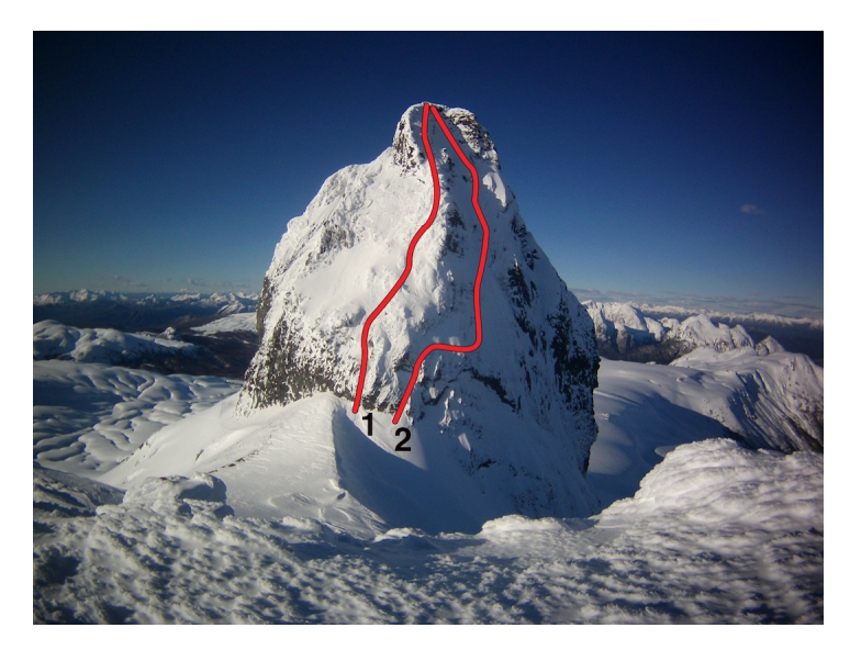
The south face of Cerro Pantojo. (1) Por Hongos y Por Honguitos. The normal route (descent route) is just to the left. (2) Supercanaleta del Pantojo.