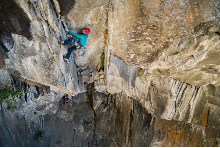
Nico Favresse on the crux pitch of Eye of Sauron (400 m, 8 pitches, 5.13 a/b), a spectacular and difficult new trad line that climbs through a large cave of dark stone just to the right of Ribbon Falls.