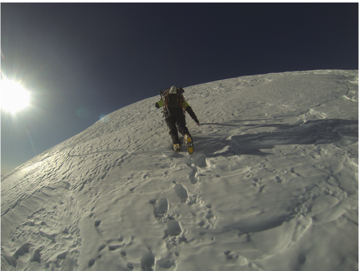
Nearing the summit of Coropuna Este.