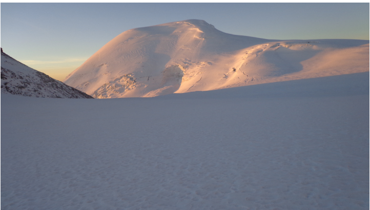
Coropuna Este from the northeast approach.