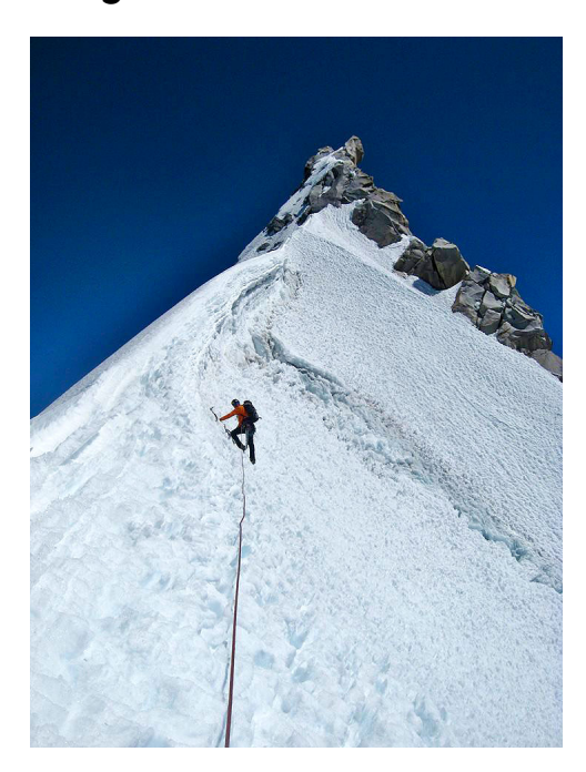
Ascending the northeast ridge of Nevado Pariacaca Sur.