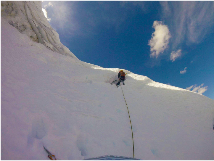
Steep snow climbing on Una Realidad Diferente (800m, MD M5) on the south face of Nevado Paca.