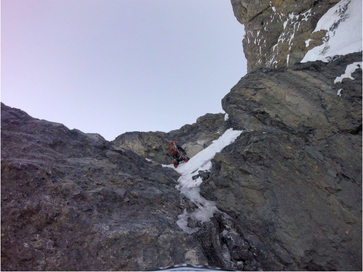
Mixed climbing on Una Realidad Diferente (800m, MD M5) on the south face of Nevado Paca.