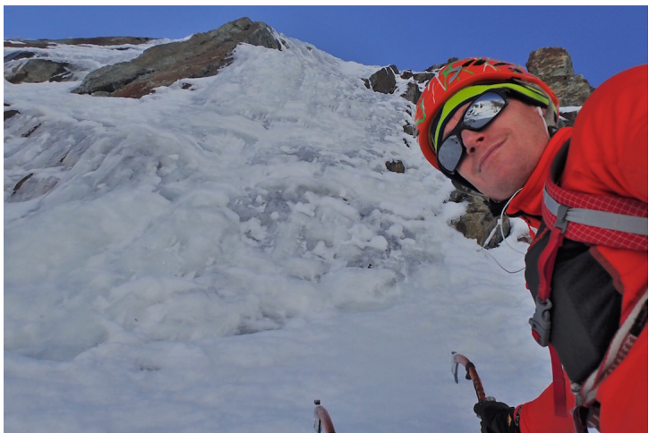
Climbing thin ice on the south face of Peak 2,472m during the first ascent of Phoenix (500m, IV, 5+).