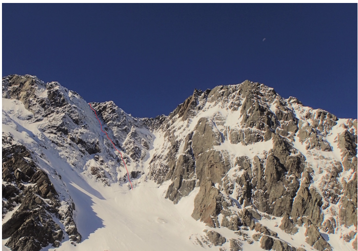
The south face of Peak 2,472m (left), with the line of Phoenix (500m, IV, 5+). The west face of Mt. Huxley is on the right.