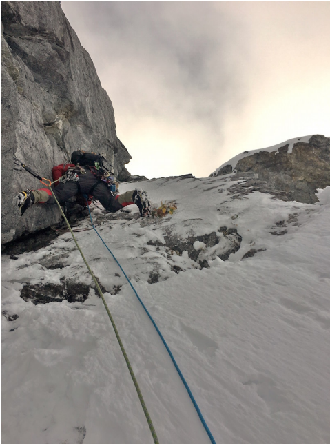
Steven Fortune on the crux mixed pitch of Dark Waters on the southeast face of Mt. McPherson.