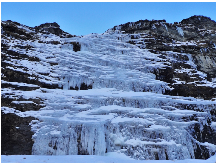
Lennox Falls (100m, WI3) in the Earnslaw Burn.