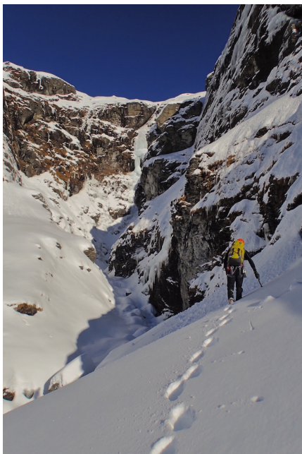
Caleb Jennings on the final section of the approach to Dream Theatre in the Earnslaw Burn.