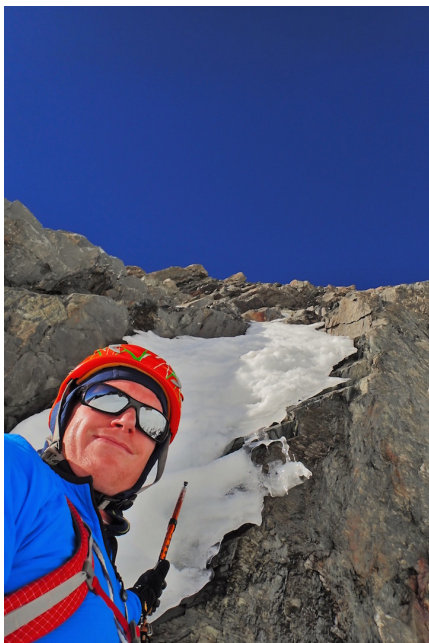
Climbing an ice runnel on the south face of Aoraki/Mt. Cook, during the first ascent of Remembrance (550m, V, 6).