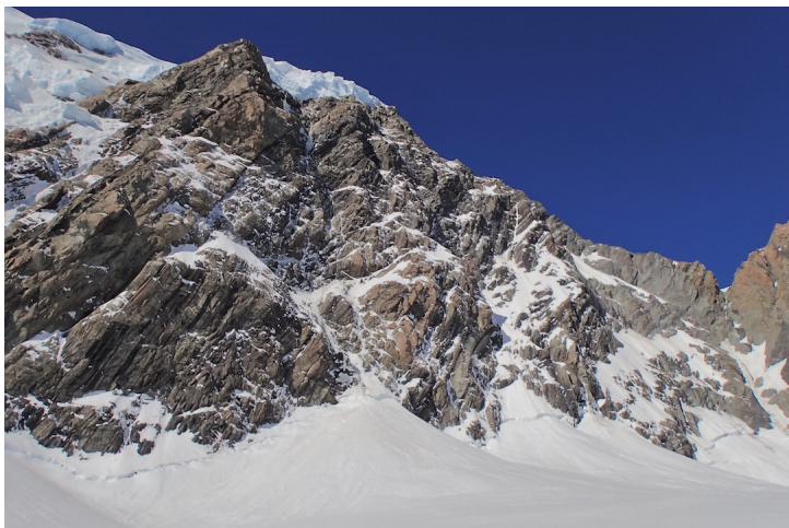
Approaching the south face of Aoraki/Mt. Cook up the Noeline Glacier.