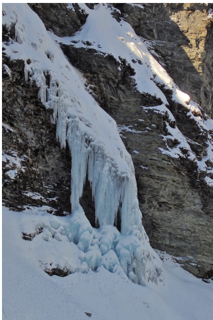
Tick, Tick, Boom (40m, WI5) in the Earnslaw Burn.