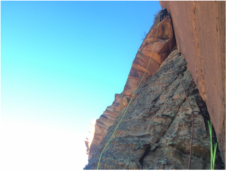
Joel Enrico cruising up typical varied Zion terrain on pitch five of True Believers (800', III+ 5.11 C2) on Johnson Mountain.