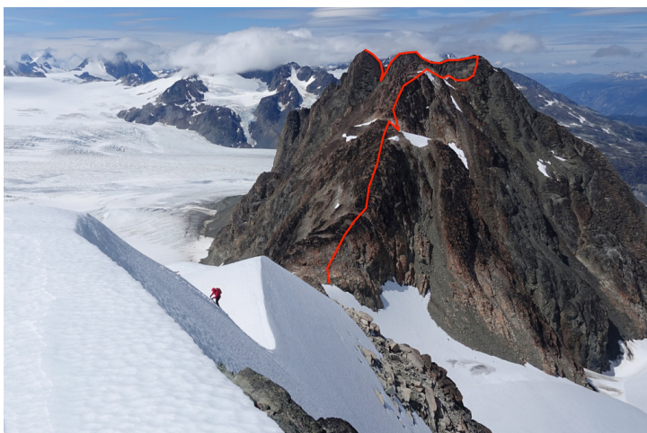
Rinn_Monarch_Sugarloaf_WEB.jpg: The Sugarloaf (2,620m) as seen from the north ridge of Peak 2,625m.