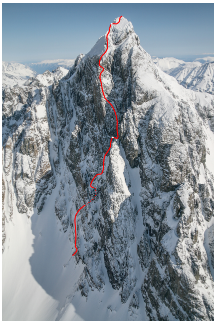
Route line for Game of Thrones (1,250m, ED2 5.10a) on the southwest face of Monarch Mountain.