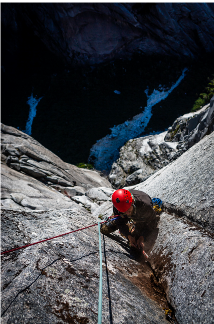
Rhane Pfeiffer cleaning the last pitch of Arrayán on Trinidad Sur.