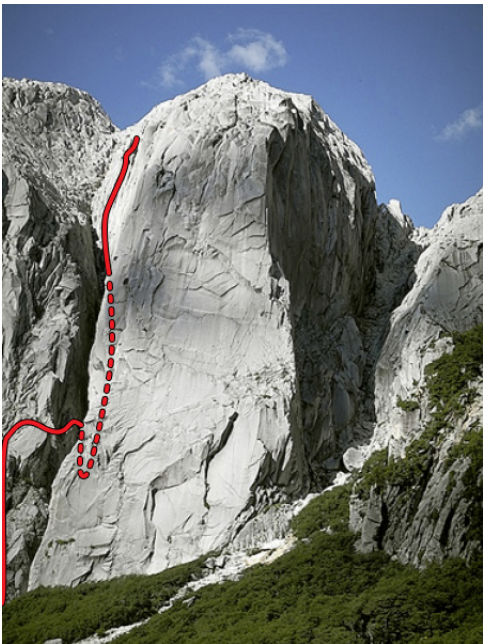
The line of Arrayán (8 pitches, 400m, 5.11 A2+) on Trinidad Sur. Note that the route begins briefly on Trinidad Central before crossing the gully to Trinidad Sur.