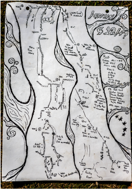
Topo of the route Arrayán on Trinidad Sur.