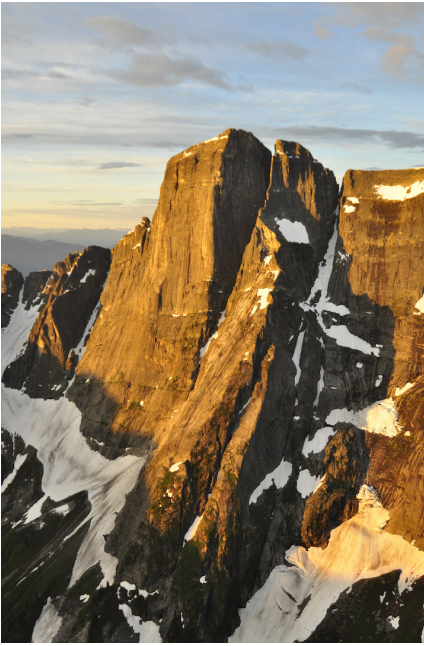
Mt. Dag from the northwest. The first ascent route, Sweet Judy Blue Eyes (Kligfield-Roskelley, 1971) was just left of the prow dividing the faces.