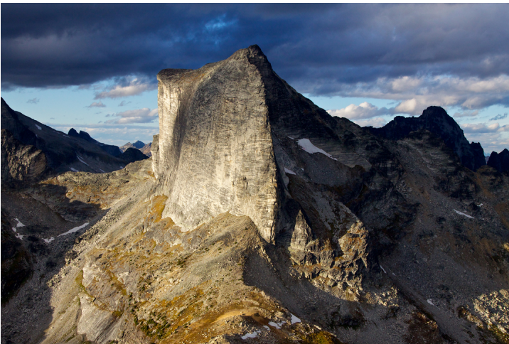
Mt. Gimli has seen at least half a dozen new five- to six-pitch routes in recent years.