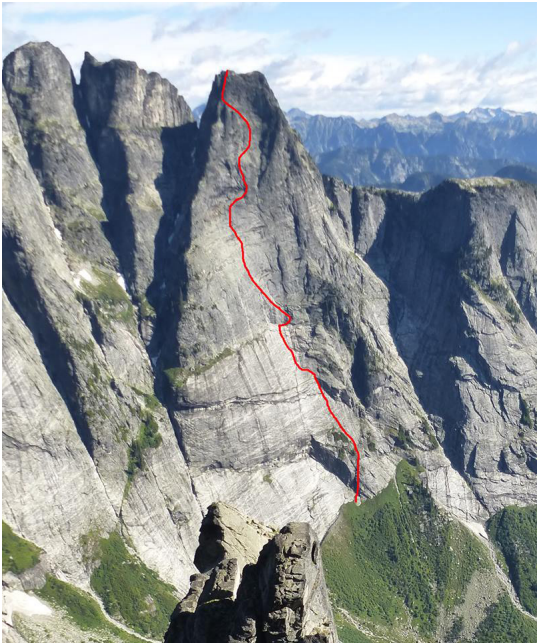
The first ascent of the south face (1,100m, ED1 5.10) on Wedge Peak.