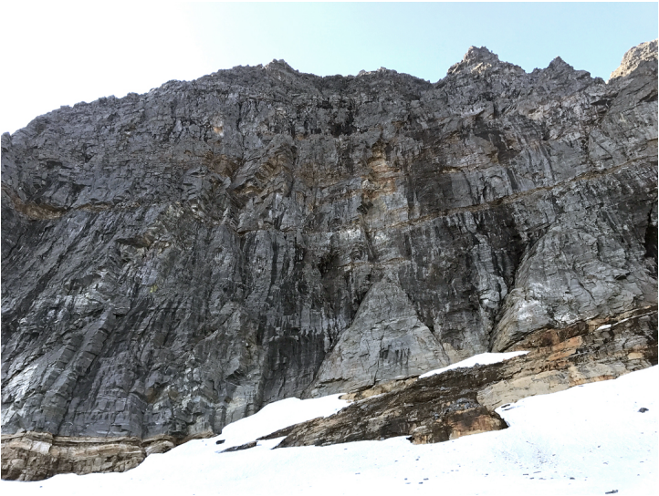
The unclimbed east face of Blåtinden.