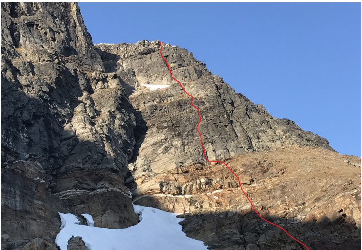
Nightwatch Pillar, the left flank of the southeast pillar of Blåtinden.