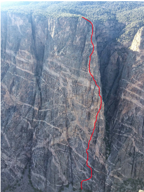
The Diagonal Wall in Colorado's Black Canyon of the Gunnison, showing the line of Mango Tango (600m, 5.11+ R/X). Hansjörg Auer