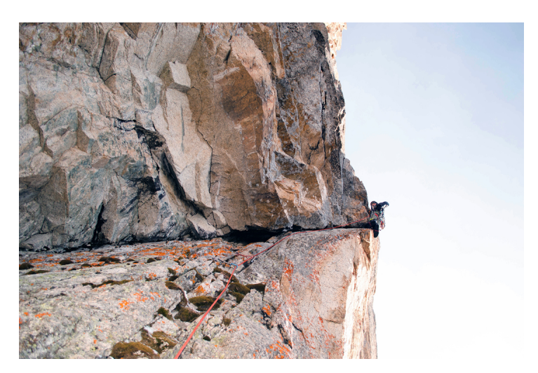
Eugeny Glaznov on one of the most difficult parts of the new route on the northwest face of Chon-tor, an overhanging section on the sixth pitch.

Eugeny Glazunov on the second pitch of the new route on the northwest face of Chon-tor, February 2016.