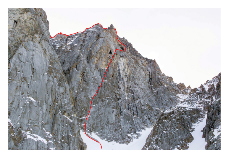
The new route on the right-hand rock buttress of the northwest face of Chon-tor. The altitude of the base of this buttress, which lies above a broad 30° snow couloir, is approximately 3,250m.