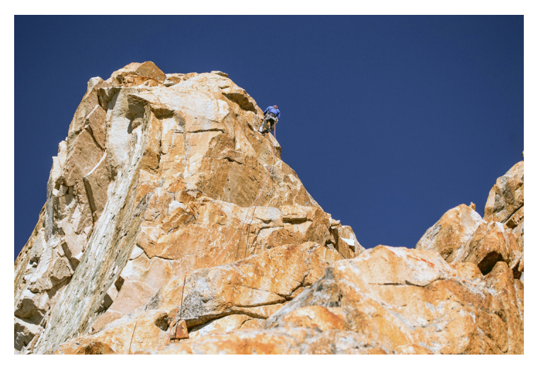
Eugeny Glazunov starting the descent from the summit.