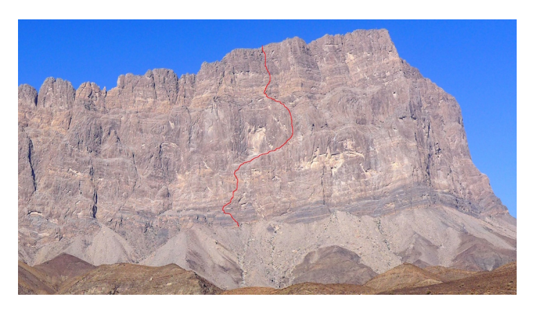
The line of Mitten ins Herz (2017) on the south face of Jebel Misht.