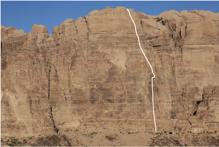
The line of Sultan ul-Mujahidin, Wadi Rum, Jordan.