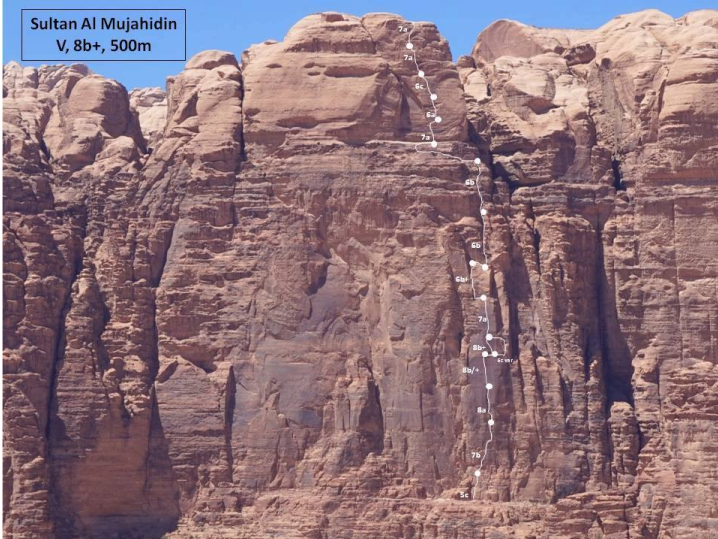
Photo-topo for Sultan ul-Mujahidin in Wadi Rum, Jordan.