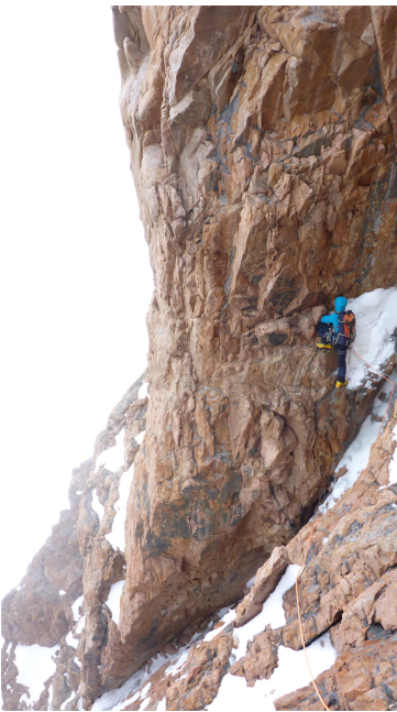
Traversing onto the steep upper pillar of the south face of Korona VI during the first ascent of Georgian Direct (900m, Russian 5B).