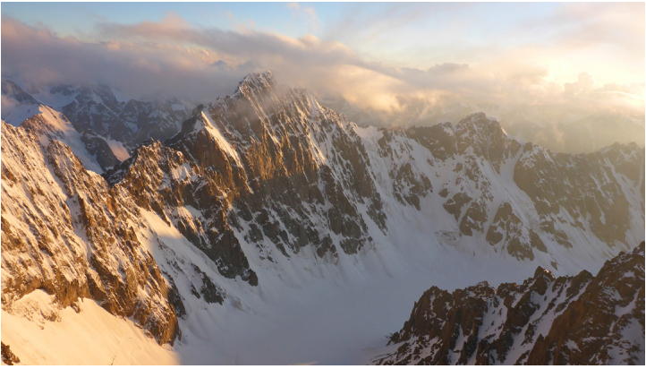
The north face of Free Korea Peak (center), rising above the Ak-sai Glacier, as seen from the south face of Korona VI.