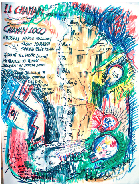
Topo for El Chamán Loco at El Salto, Mexico.