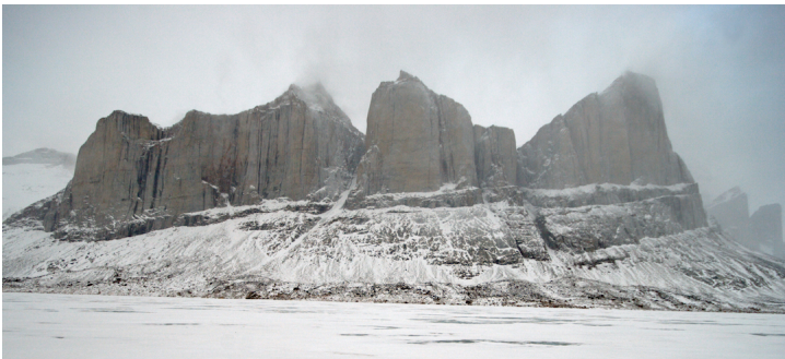
The Mirror Wall in center, with the Citadel on the left and Great Sail Peak on the right.