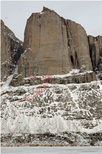
Photo topo for Sensaciones, Mirror Wall, Stewart Valley, Baffin Island.