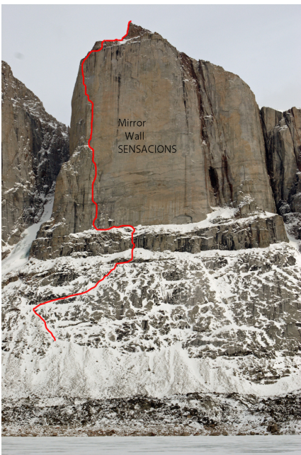
The line of Sensaciones (2010) on the Mirror Wall, Stewart Valley, Baffin Island.