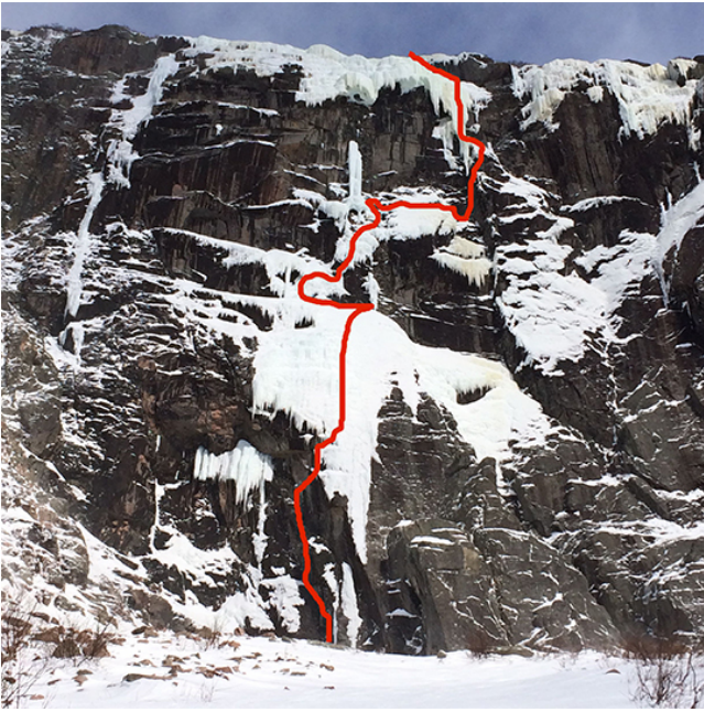
The line of Apocalypse Now (220m, WI7 M9).