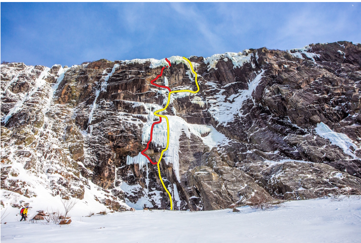
The lines of The Lion, the Witch, and the Wardrobe (2016, red) and Apocalypse Now (2015, yellow) on the 220-meter Cholesterol Wall, above Ten Mile Pond in Gros Morne National Park.