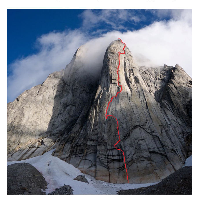
The Minaret, showing the line followed for the first free ascent of Retinal Circus (600m, 5.12+). The climbers likely deviated from the original 2001 route several times in search of free climbing terrain. Just left of this formation is the classic Beckey-Chouinard Route on South Howser Tower.