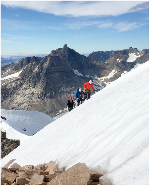
On the summit snow ridge of Qaggaq Aoife, with Peak 1,180m in the background.