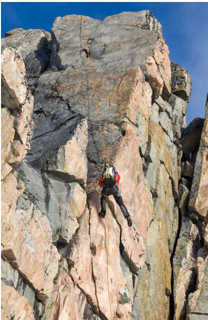
Rappelling the rock barrier on Qaggaq Aoife during the descent.