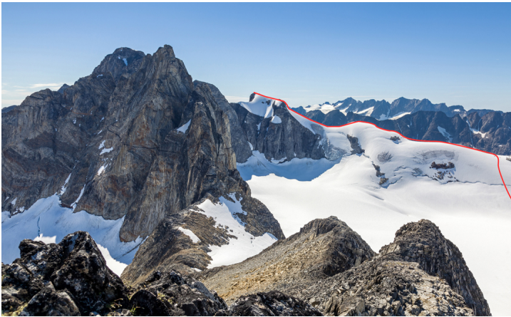
Qaqqaq Aoife (1,194m) and route of ascent, as seen from the north. The large, rocky peak at left is 1,367m.