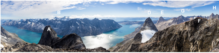
Panorama to the northwest from Qaqqaq Aoife's southeast summit. (A) Peak 1,116m. (B) Mountains immediately north of Tasiilaq. (C) Ikaasatsivaq Fjord. (D) Niialigaq. (E) Paarnartivartik. (F) Qaqqaq Aoife northwest summit. (G) Peak 1,180m. (H) Niiniartivaraq (1,270m).