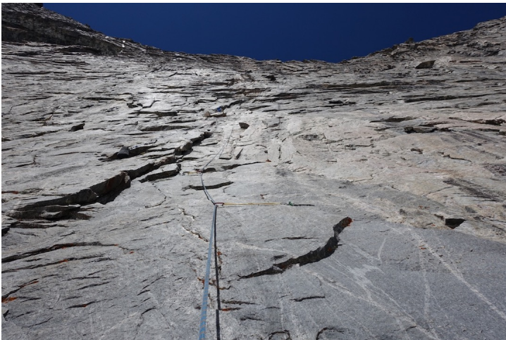
Looking up the second pitch of Medicine Crow (1,100', 5.11+ R) on the east face of Cloud Peak. Gray and Marine climbed ground-up, establishing a bolted rappel route along the way. They fixed lines and returned to the ground each night.