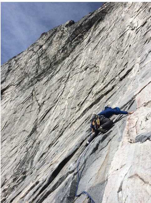
Alex Marine leading pitch two of Medicine Crow (1,100', 5.11+ R) on the east face of Cloud Peak.