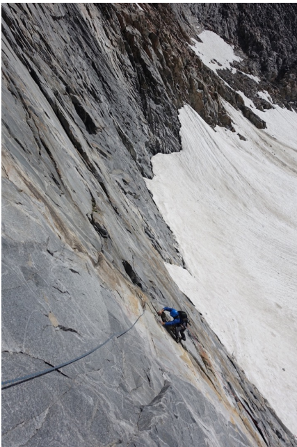
Alex Marine following the first pitch of Medicine Crow (1,100', 5.11+ R) during the first ascent. Gray and Marine's route marks only the second full line on Cloud Peak's main east face, which they completed after four days of effort.