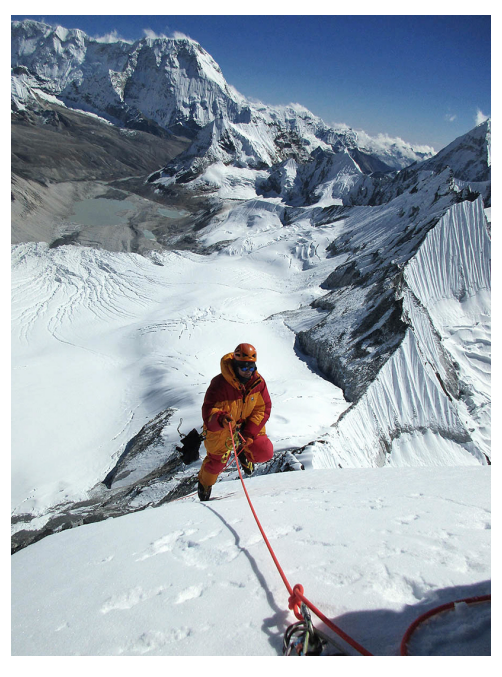
On the upper section of the southwest ridge of Ombigaichen, with Chamlang and the Hunku Valley behind.