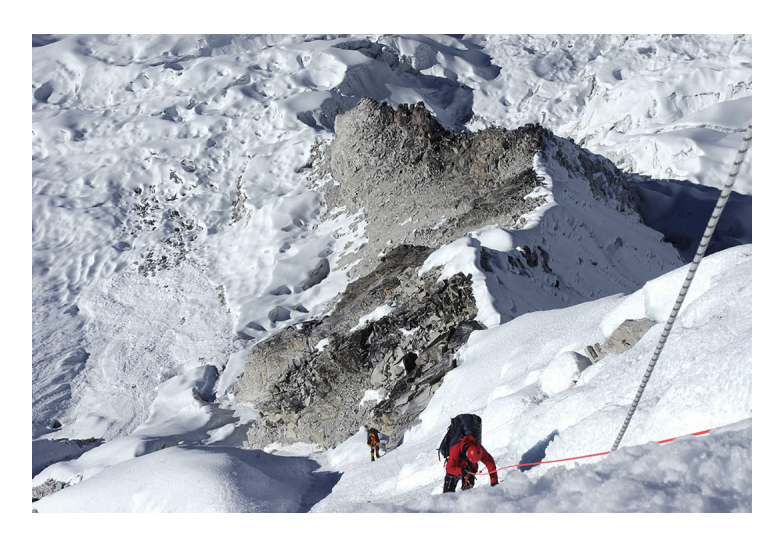
On the initial section of the southwest ridge of Ombigaichen.