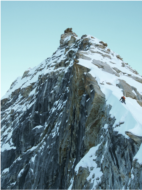
Heading for the summit on the upper northwest ridge of Kangchung Shar.