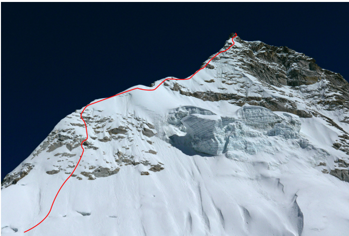
The upper northwest ridge of Kangchung Shar and the line taken on the 2016 ascent.