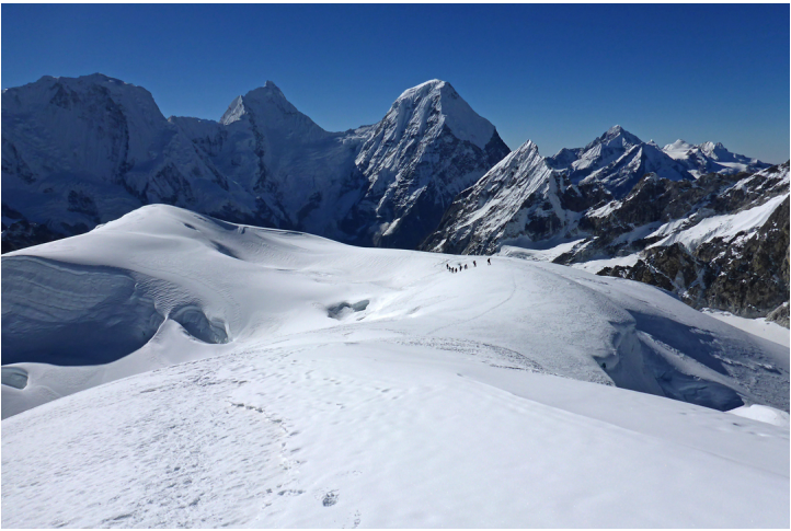
The final section of the southwest ridge of Karbu Ri (6,010m GPS), with members of the British expedition en route to the summit. The view is looking south toward the big peaks of (left to right) Peak 6,664m, Takargo (a.k.a. Thakar Go, 6,771m), and Chobutse (6,686m).