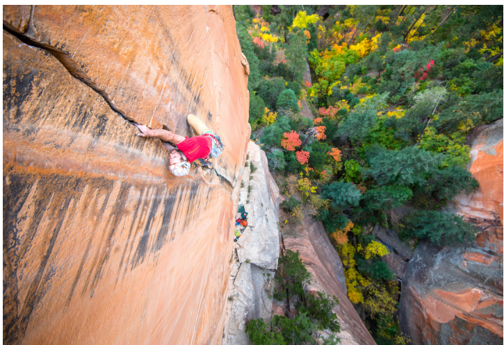
Jeff Snyder on the splitter crux third pitch of Life Without Parole (5.12-), in Insomnia Canyon, a sheer offshoot canyon in the west fork of Oak Creek Canyon. The first ascensionists were tipped off to the canyon's climbing potential after watching a local search and rescue team's slideshow