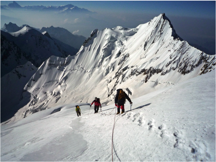
The final ascent up the south face of Vishnu Killa, with unclimbed Peak 5,880m behind.