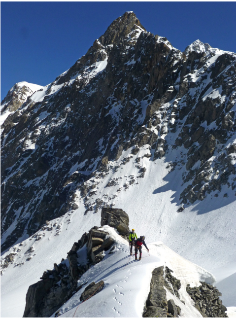
Climbing at 5,100m on the Gimme-Kalapani watershed during the approach to Vishnu Killa.